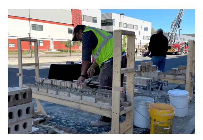
Hands-on at the Hmong College Prep Academy

Apprenticeship classes are back in full swing despite remediation at the Training Center. We had 30 new apprentices, and a total of 75 apprentices in attendance last week. Orientation night is always long and crammed full of required paperwork and policy review, but it's also an exciting time to meet our new classmates and catch-up with old friends. Both first year brick and tile finisher classes have been split into two groups due to their size, these students should have received text messages with their respective assignments.