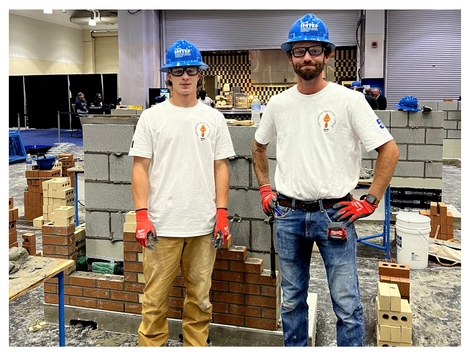
The International Apprentice Contest

The International Apprentice Contest took place on September 23-24 in Boston, Mass. Seventy-five of the top apprentices in the International Union competed to earn the title of International Craft Champion in the following crafts: brick, pointing-cleaning-caulking, stone, tile, marble, terrazzo, cement, and plaster.